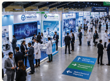
Manufacturing Exhibitions, Medical & Pharma Exhibitions