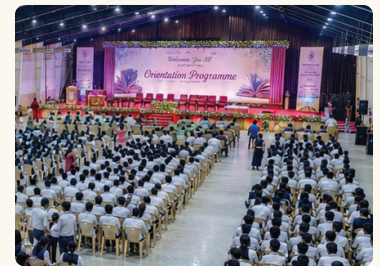
Government, Institutional Events