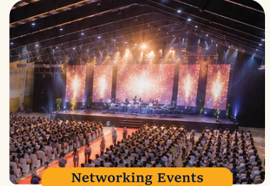
Networking Events TED style Talks