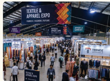
Technology Shows, Textile & Apparel Shows