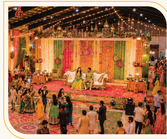
Mehendi & Sangeet Functions