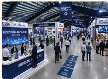
Industrial Expos, Automobile Expos