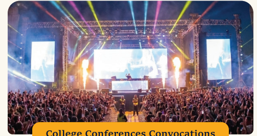
College Conferences Convocations