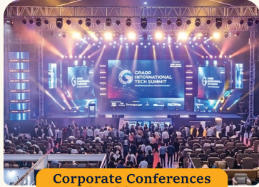
Corporate Conferences Leadership Summits