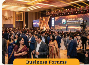
Business Forums Investor Meets