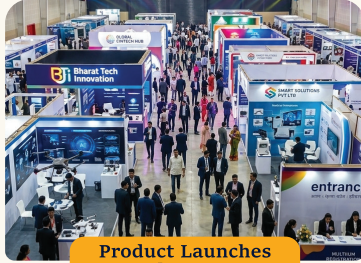
Product Launches Dealer Meets