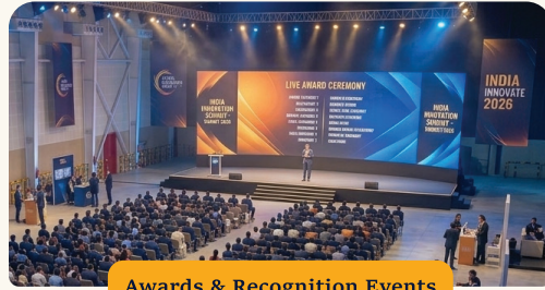
Awards & Recognition Events