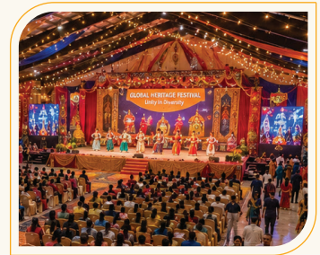
Family Celebrations & Cultural Events