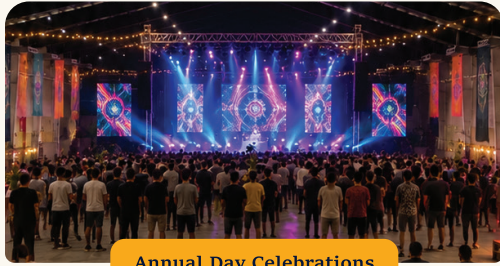
Annual Day Celebrations